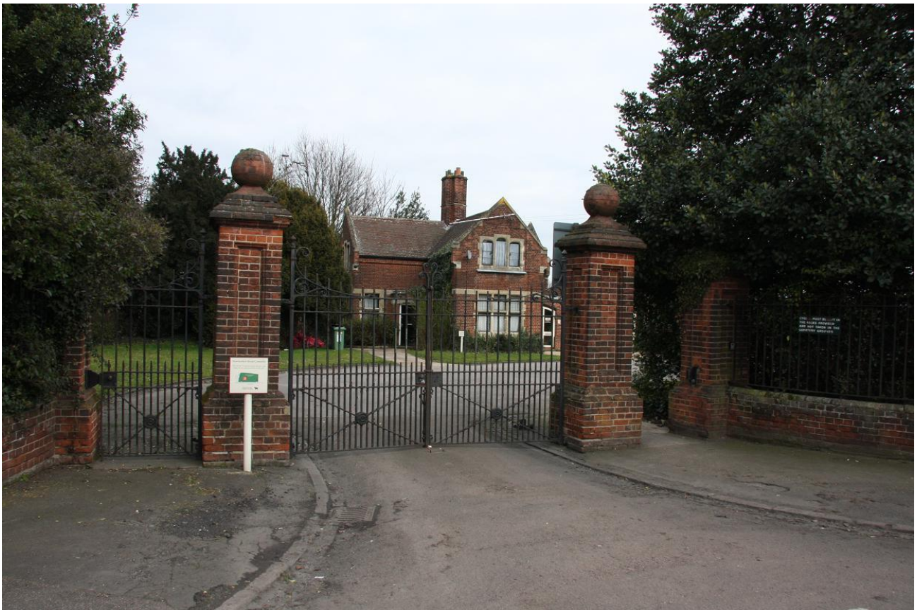
Entrance to Cambridge City Cemetery & Map (below)