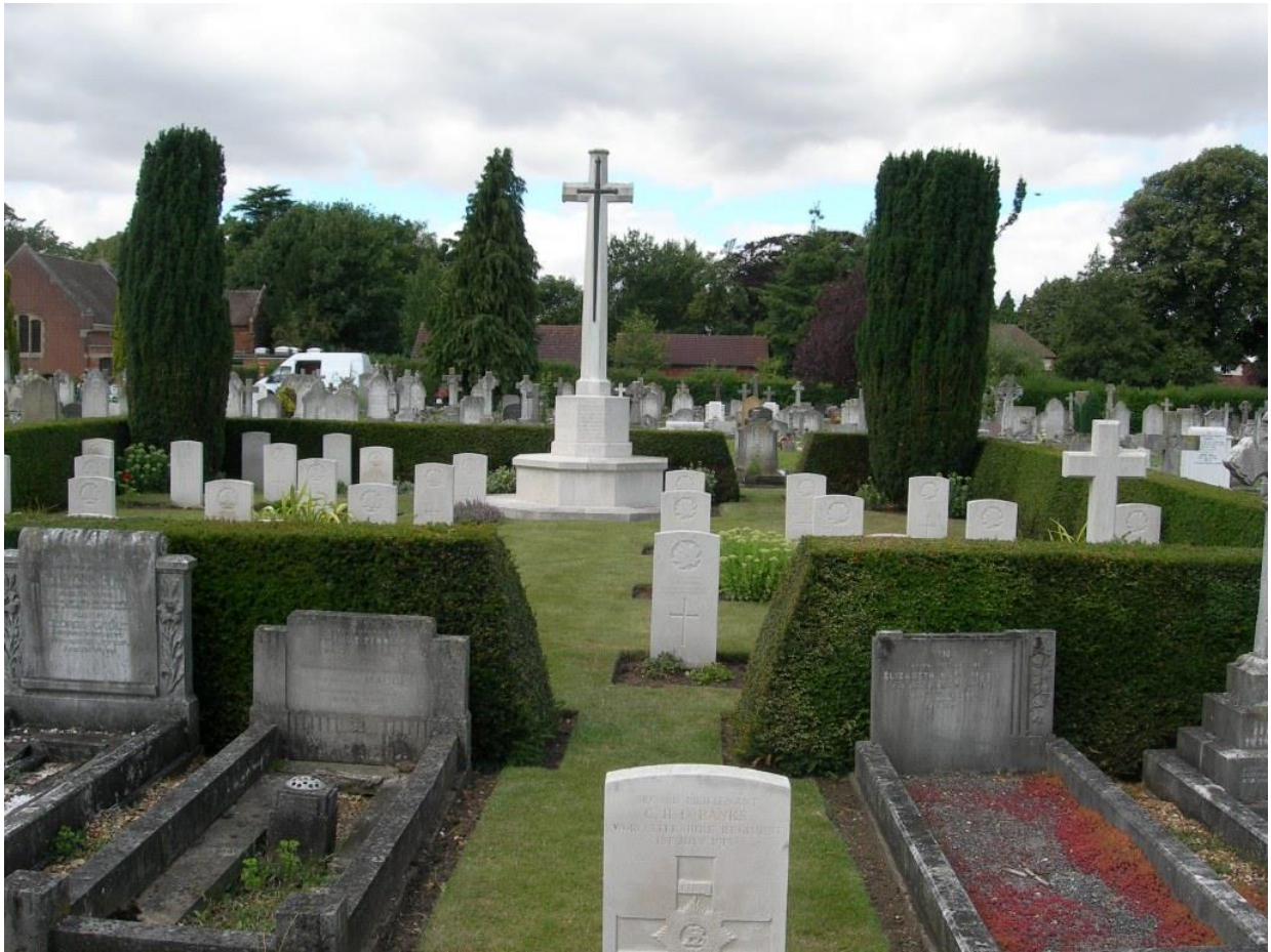
Cross of Sacrifice